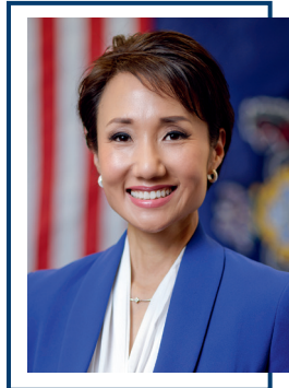
STATE SENATOR PATTY KIM